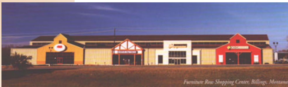
Furniture Row Shopping Center, Billings, Montana

EPI recently attended the Geo-Frontiers 2005 conference and trade show in Austin, TX where we participated in thermal welding demonstrations and