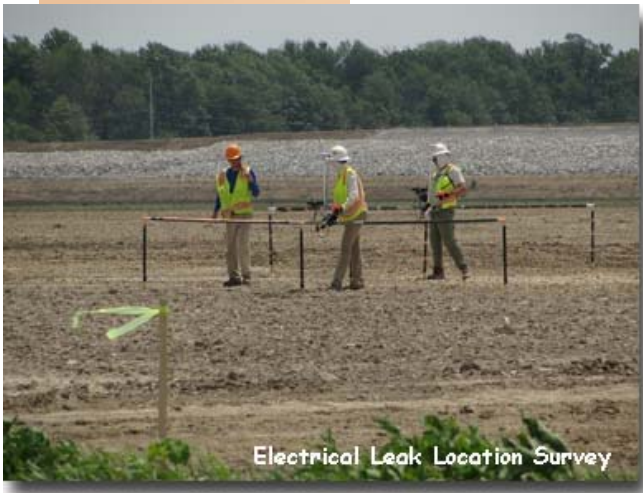
Electrical Leak Location Survey

In June 2012 a Geo-Logic crew led by Abigail Beck surveyed 150 acres of completed EPI installed geomembrane. They found only 15 holes! Nine were caused by stones in the cover soil, four were equipment damage, and two were cuts. All holes were excavated, repaired, and re-surveyed. For more information call EPI toll free at 800-OK-LINER.